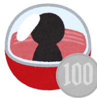
the ¥100 toy