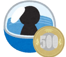
the ¥500 toy